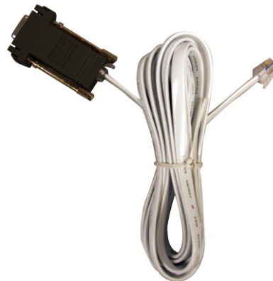
Figure 2. RS-232 Direct-Connect Cable with 9-pin DB adapter and RJ-11 plug